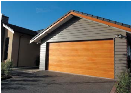
Above top: Vertical Cedar