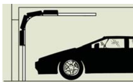
Below: Sectional door operation